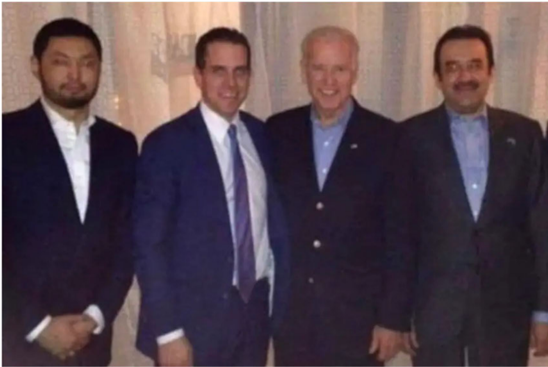
Figure 8 (From left to right) Kenes Rakishev, Hunter Biden, Vice President Biden, and Karim Massimov.